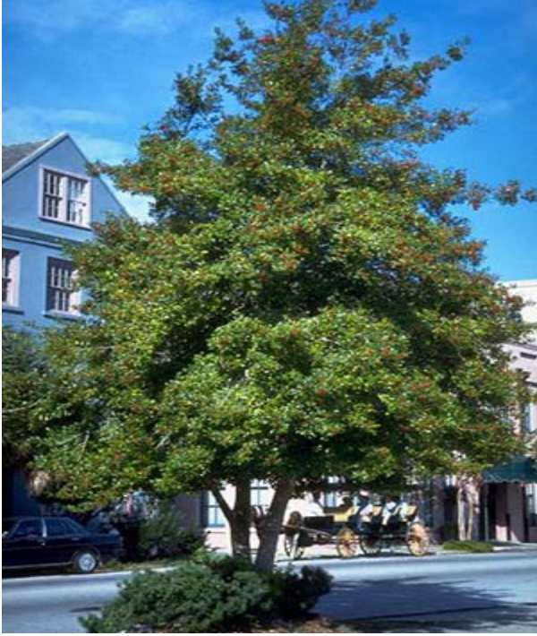
East Palatka holly Florida native grows in a pyramid shape needs some space