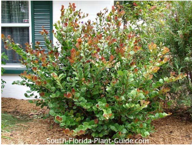
Cocoplum a Florida native needs