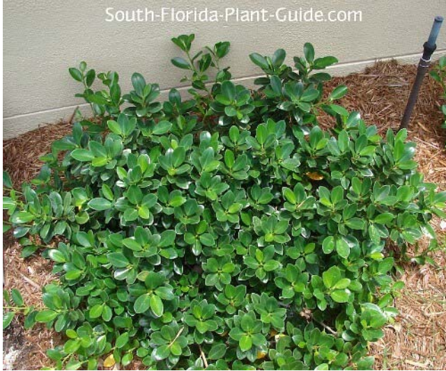
Green Island ficus nonnative good for smaller spaces