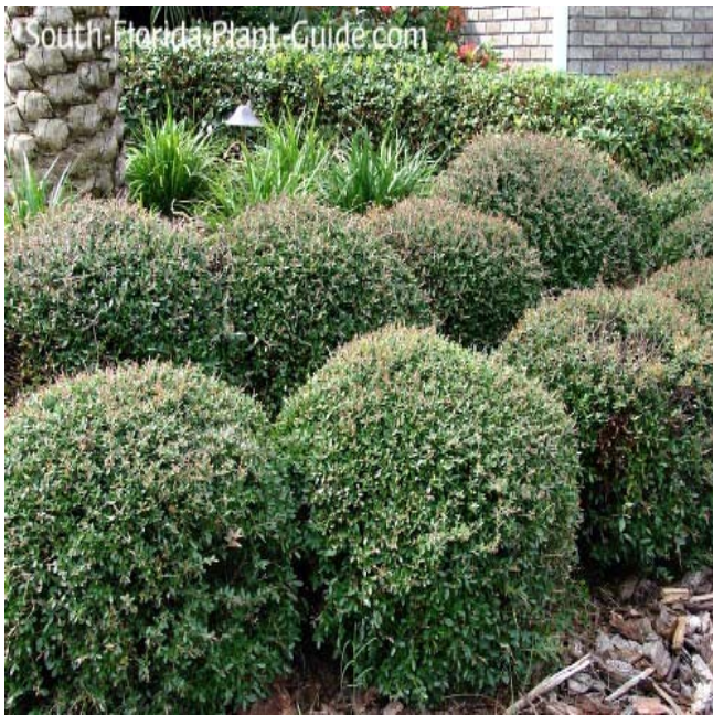
Ilex shillings nonnative but great