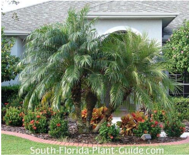
Phoenix roebelenii nonnative but a nice small palm for smaller spaces