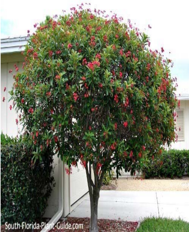
South-Florida-Plant-Guide.com Jatropha nonnative great for smaller spaces needs a hard cut once a year