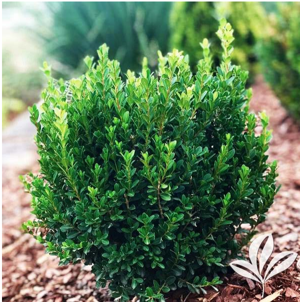
Japanese boxwood nonnative but great for small spaces